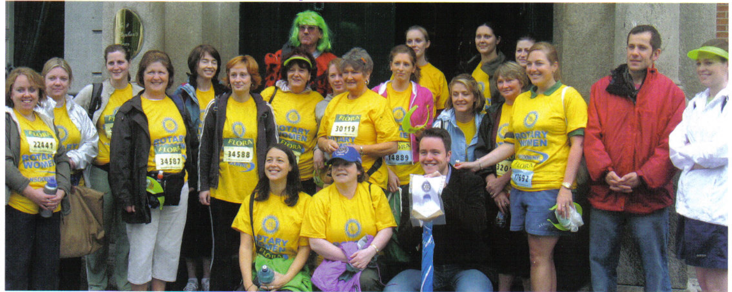
Dublin Central raised €1000 doing the Women's mini marathon in June with some help from the Portadown club!!