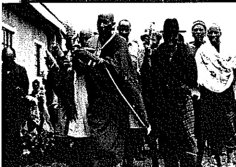
Official Opening of BELGROVE SCHOOL Lemongo, Kenya